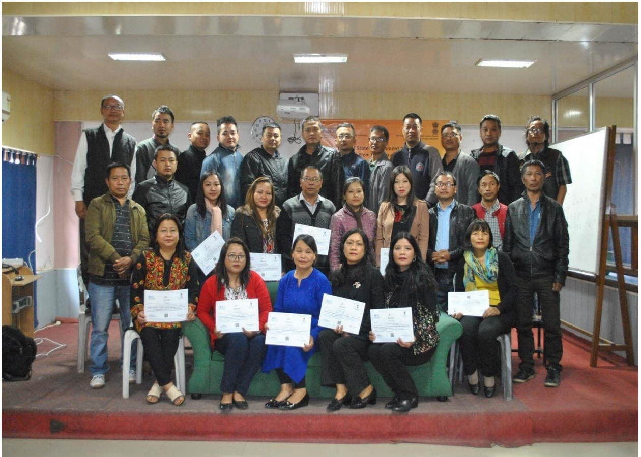
Pic 6: Trainees