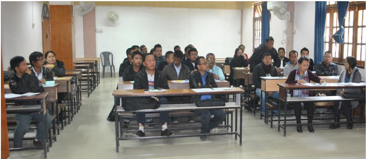
Pic 2: Inauguration Programme- Trainees