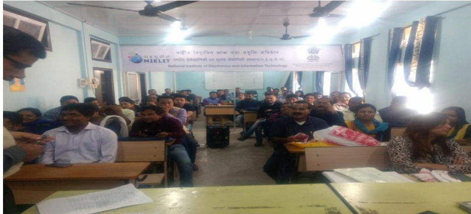
NIELIT Guwahati Jorhat Extension Centre