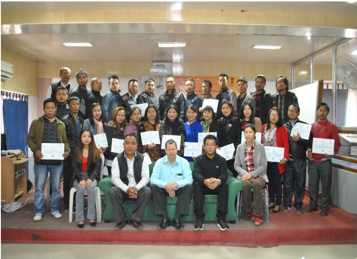
Pic 4: Trainees and NIELIT Staff