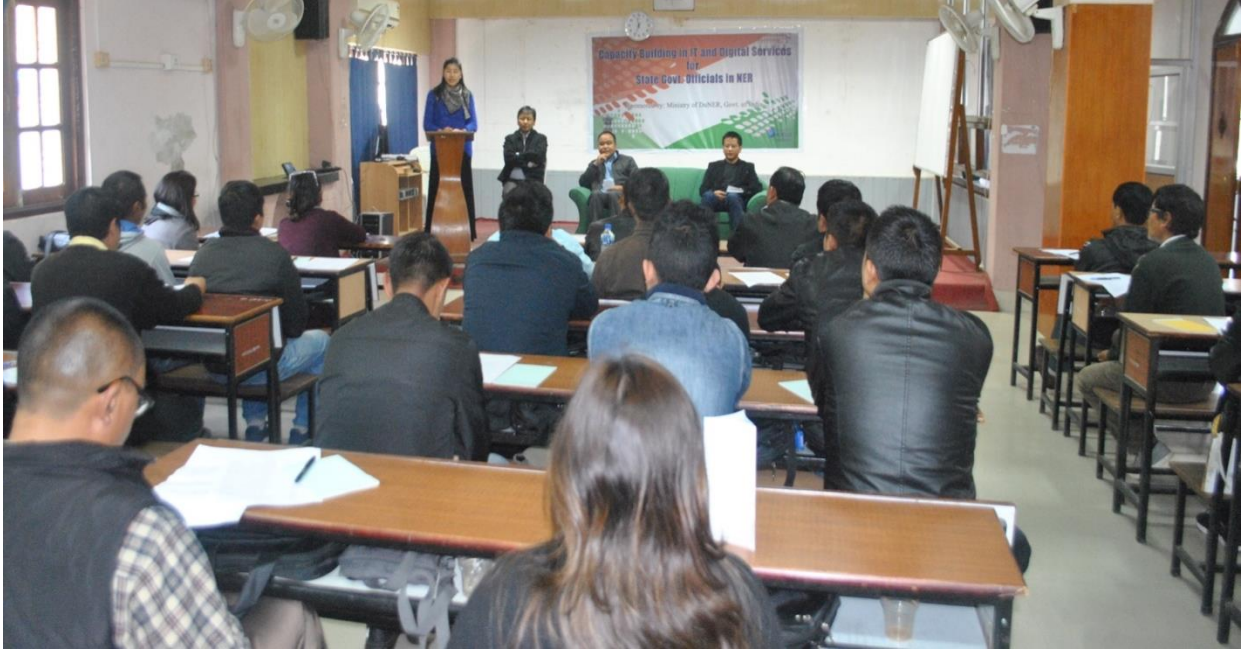
Pic 1: 1 st Batch Training Inauguration