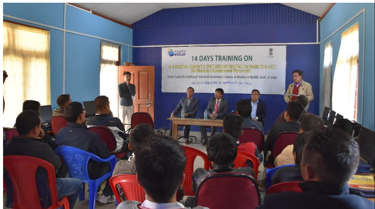
Certificate Distribution at Gadailong Primary School, Tamenglong