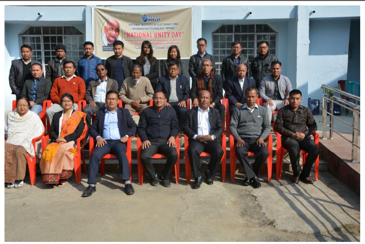
Participants of Batch-02 with Executive Director, NIELIT and other officials of Imphal