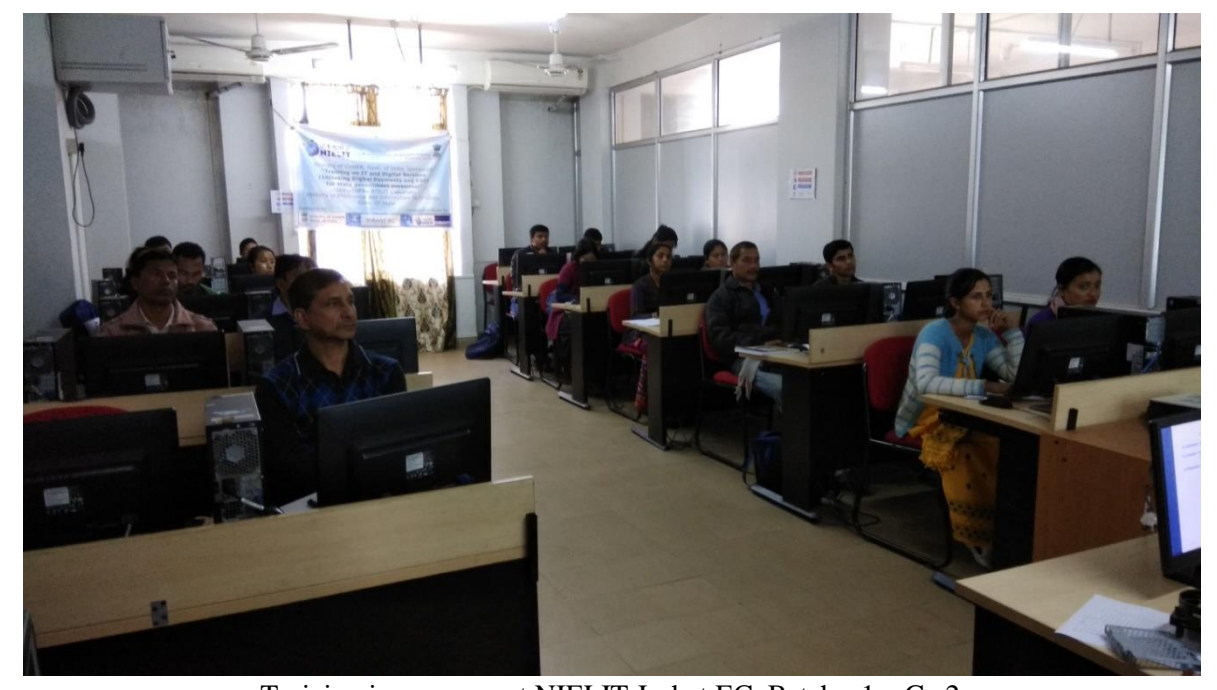
Training in progress at NIELIT Jorhat EC, Batch - 1 - Gr-2