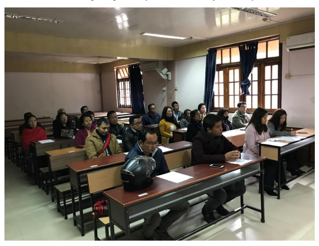
Pic 2: Inauguration Programme- Trainees