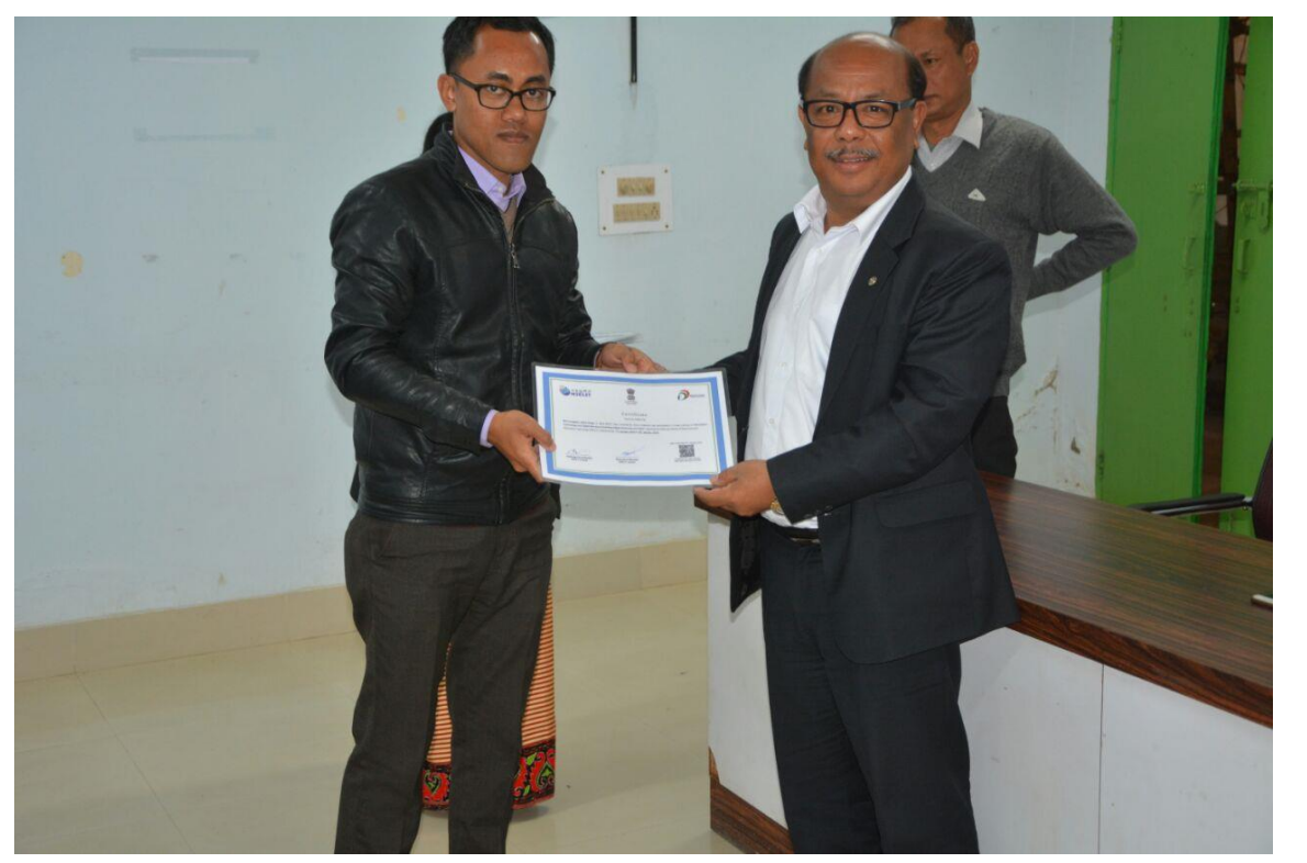
Executive Director, NIELIT awarding participation certificate to one of the participant of batch-02