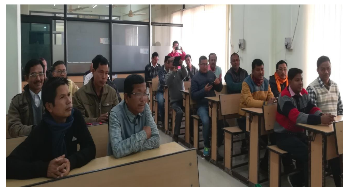
Participants of Batch-01 Training from education Department, RMSA Kokrajhar