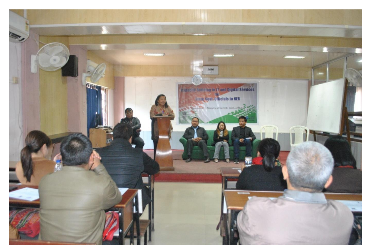
Pic 3: Certificate Distribution Programme- Speech from Trainees