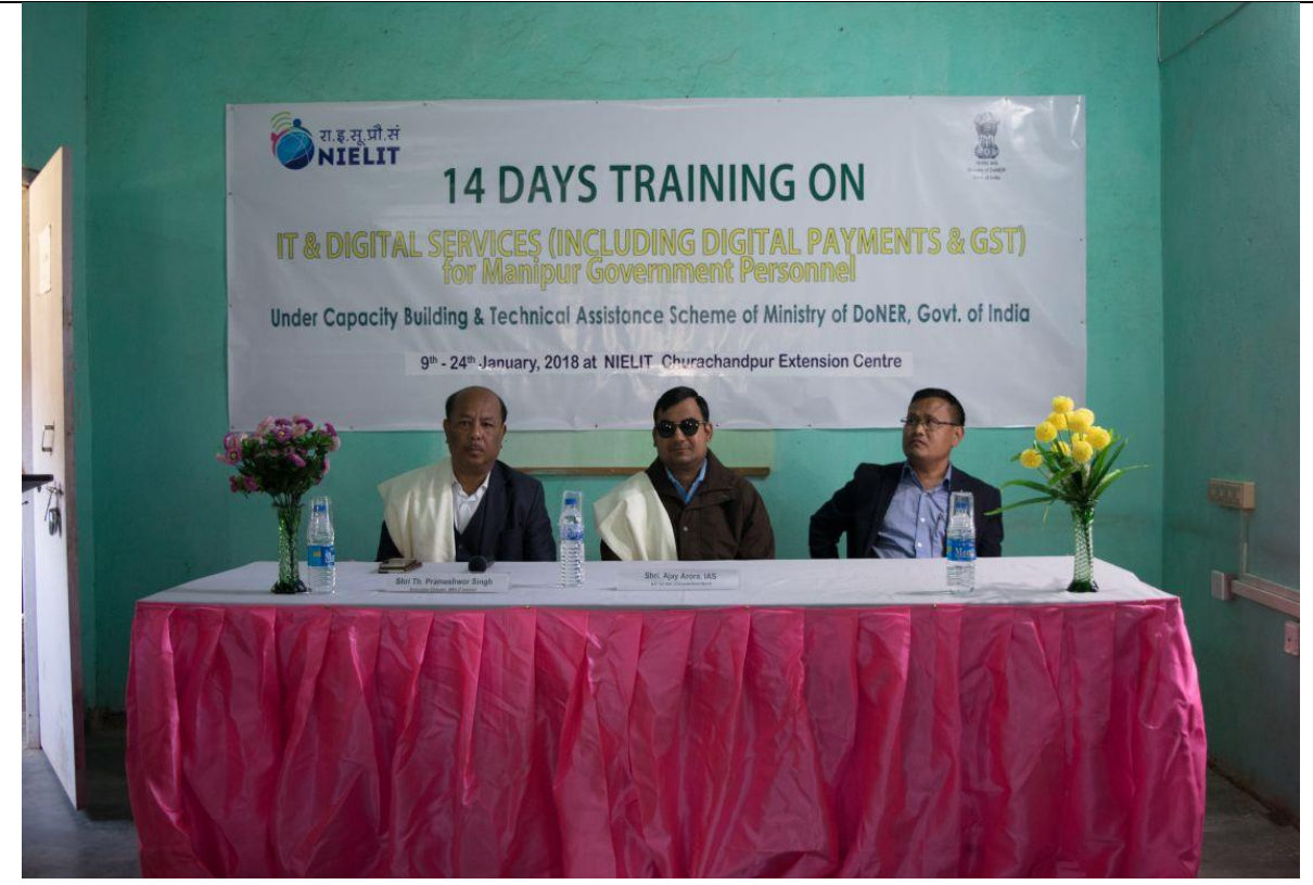
Shri. Ajay Arora, IAS, Asst. Commissioner, Churachandpur inaugurating batch-01 training at Churachandpur