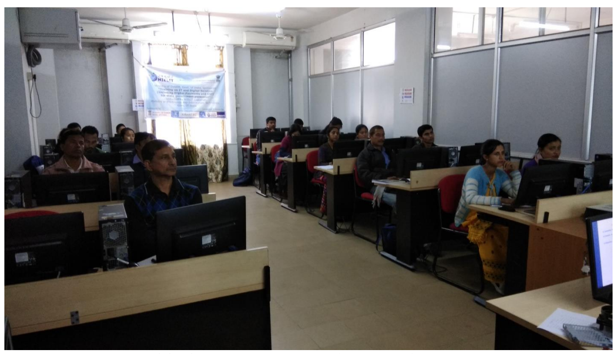
Training in progress at NIELIT Jorhat EC, Batch - 1 – Gr-2