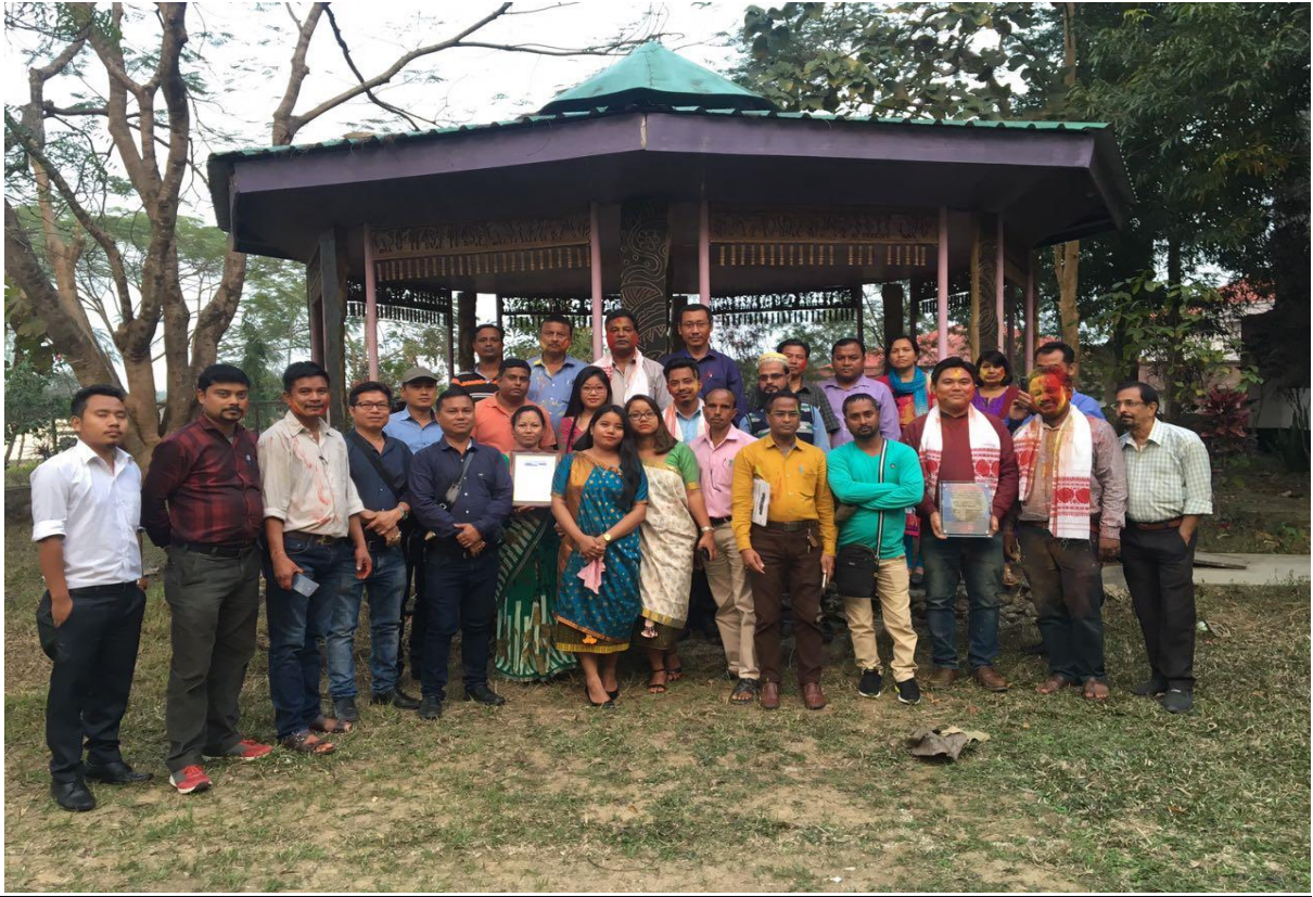
NIELIT GUWAHATI DIBRUGARH EXTENSION CENTRE