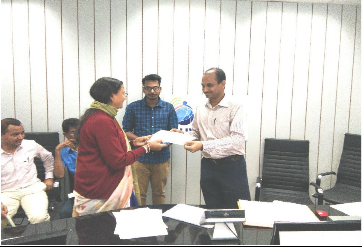
NIELIT GUWAHATI TEZPUR EXTENSION CENTRE