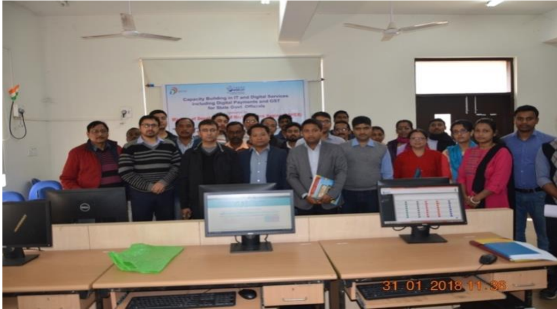
Participants of 1 st Batch- of Training along with Director, IT, Govt of Tripura, Director In-charge, NIELIT Agartala, Officials and Faculties of NIELIT Agartala