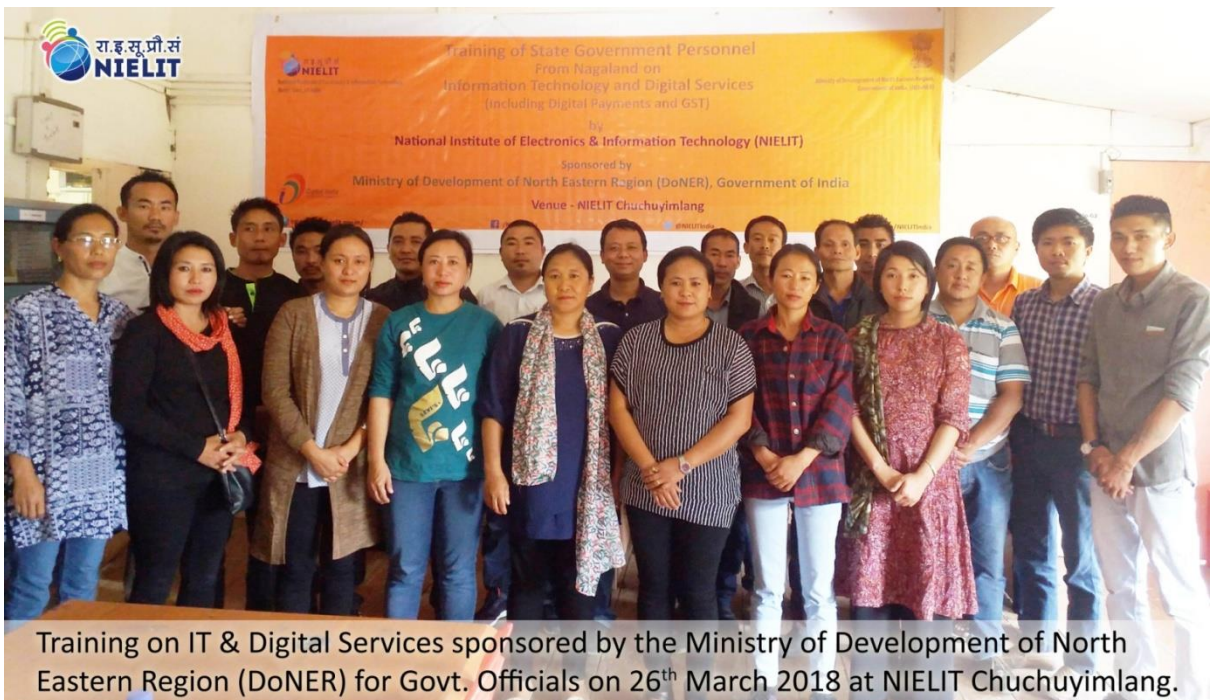
Training on IT & Digital Services sponsored by the Ministry of Development of North Eastern Region (DoNER) for Govt. Officials on 26 th March 2018 at NIELIT Chuchuyimlang.