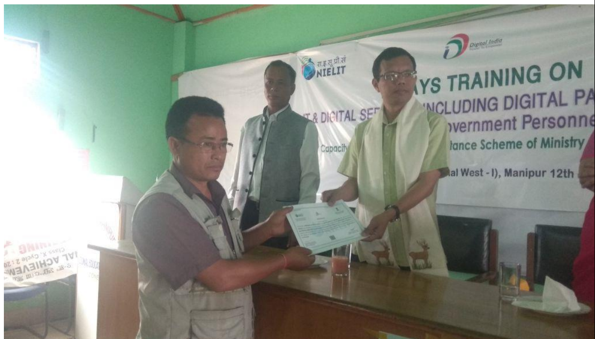
Certificate Distribution by Director, Education (S) Department, Govt. of Manipur to and certification 48 th batch training at Imphal.