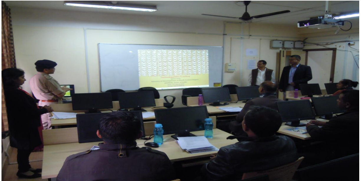
Shri. H.Nongpluh, IPS Inspector General of Police, (TAP), Meghalaya inaugurated the first batch of training program under capacity building and technical assistance scheme of Ministry of DoNER, Govt of India