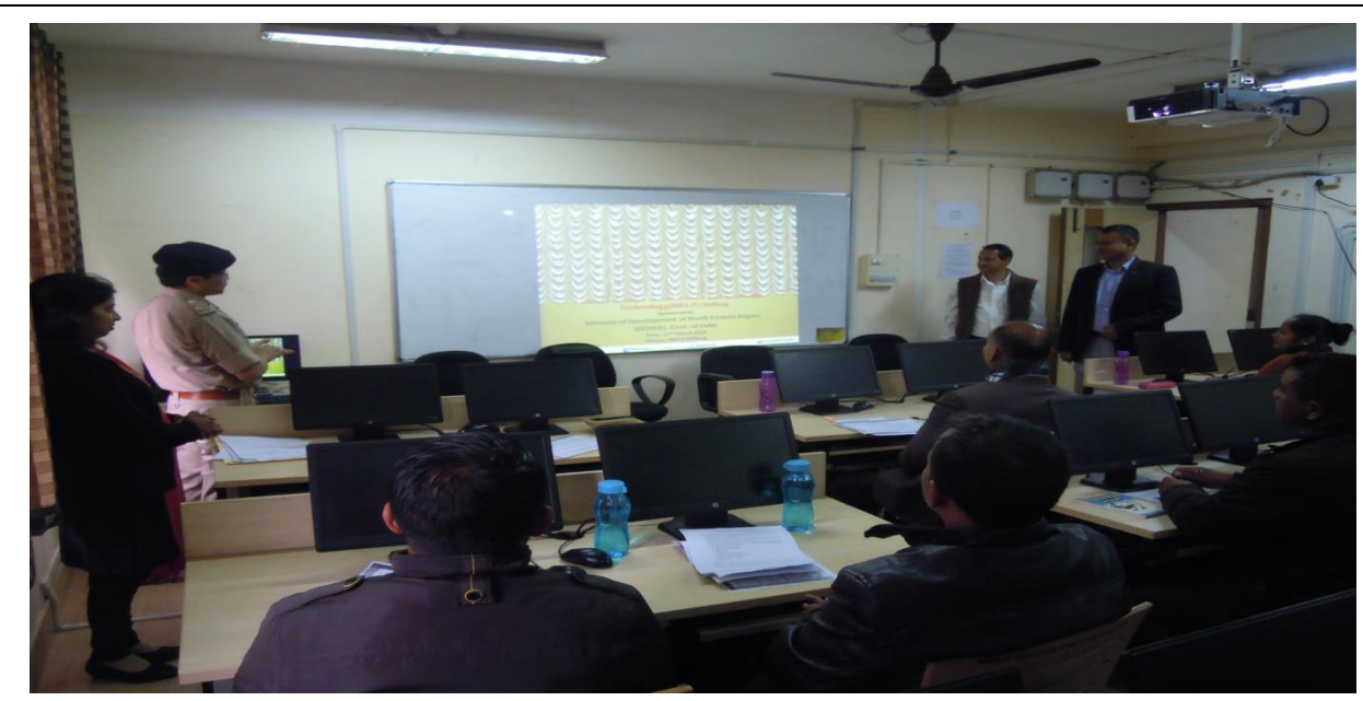
Shri. H.Nongpluh, IPS Inspector General of Police,(TAP),Meghalaya inaugurated the first batch of training program under capacity building and technical assistance scheme of Ministry of DoNER, Govt of India