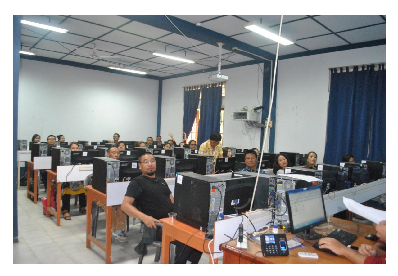
Pic. 5:-Training Room