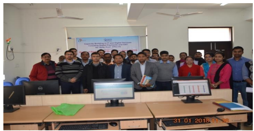
Participants of 1<sup>st</sup>Batch- of Training along with Director, IT, Govt. of Tripura, Director In-charge, NIELIT Agartala, Officials and Faculties of NIELIT Agartala