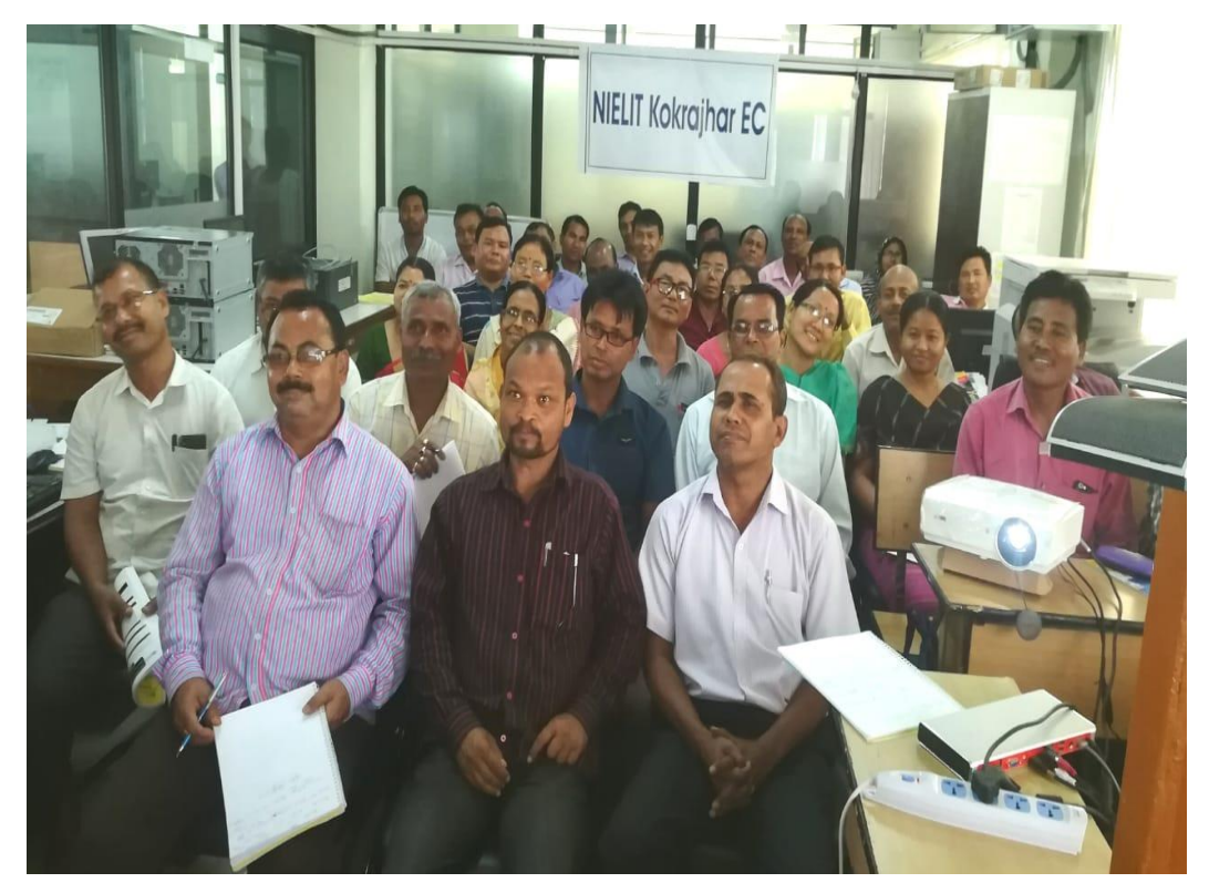
NIELIT GUWAHATI SILCHAR EXTENSION CENTRE