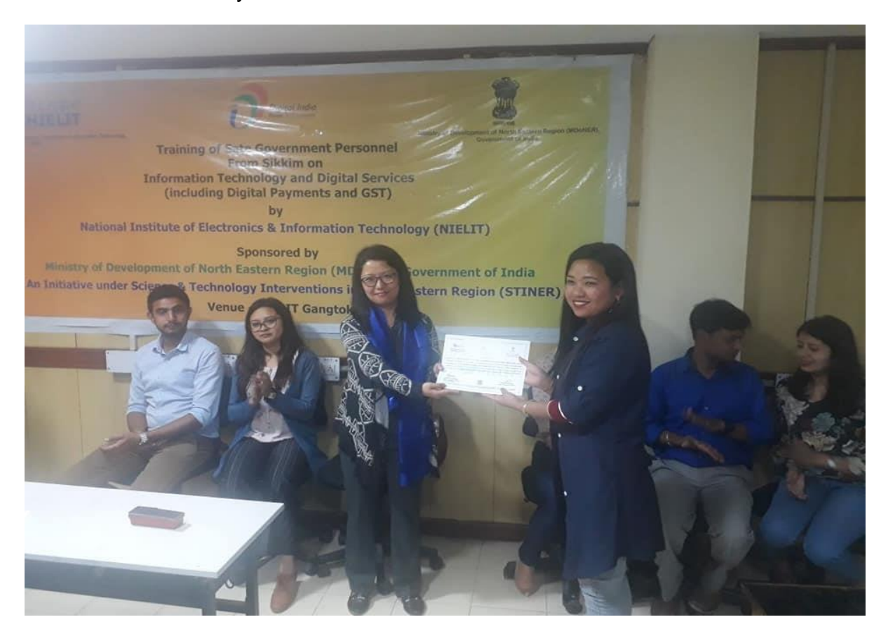
Photo 6: Participants receiving the certificates from the hands of Assistant Director (IT), RMDD, Govt of Sikkim in the presence of officials of NIELIT, Gangtok