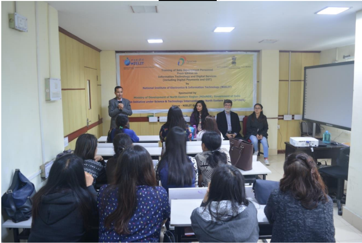
Photo 1: Inauguration session. NIELIT officials interacting with the participants during the inauguration of the 83<sup>rd</sup> batch at NIELIT, Gangtok on 7<sup>th</sup> May 2018.