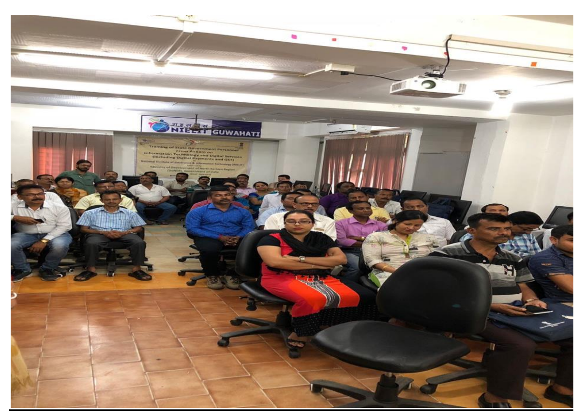
NIELIT GUWAHATI CITY CENTRE