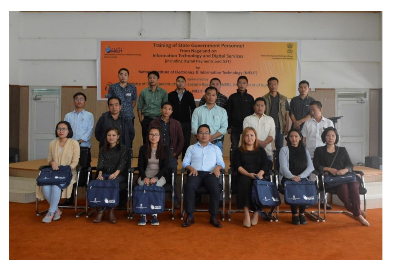
Certificate distribution for 84th Batch