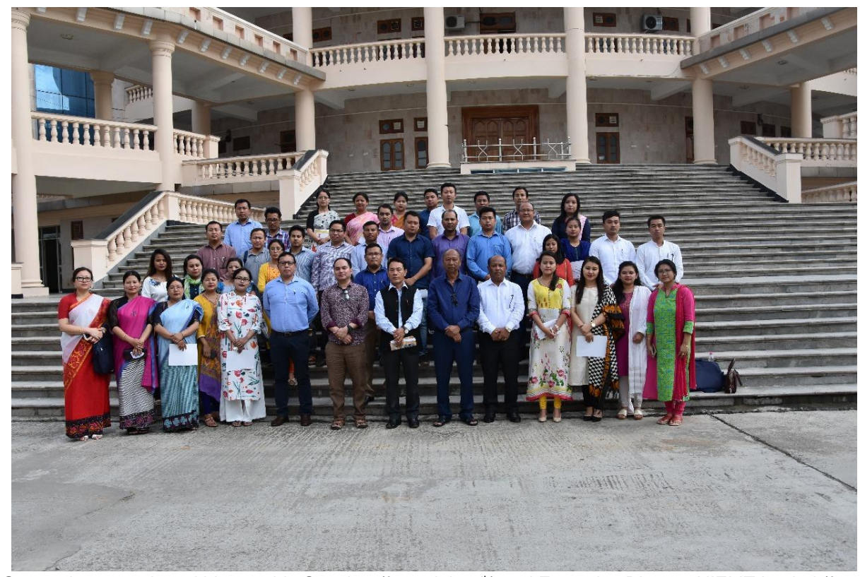
Group photo session withhonorable Speaker (from right 6<sup>th</sup>) and Executive Director NIELIT Imphal (from right 5<sup>th</sup>)