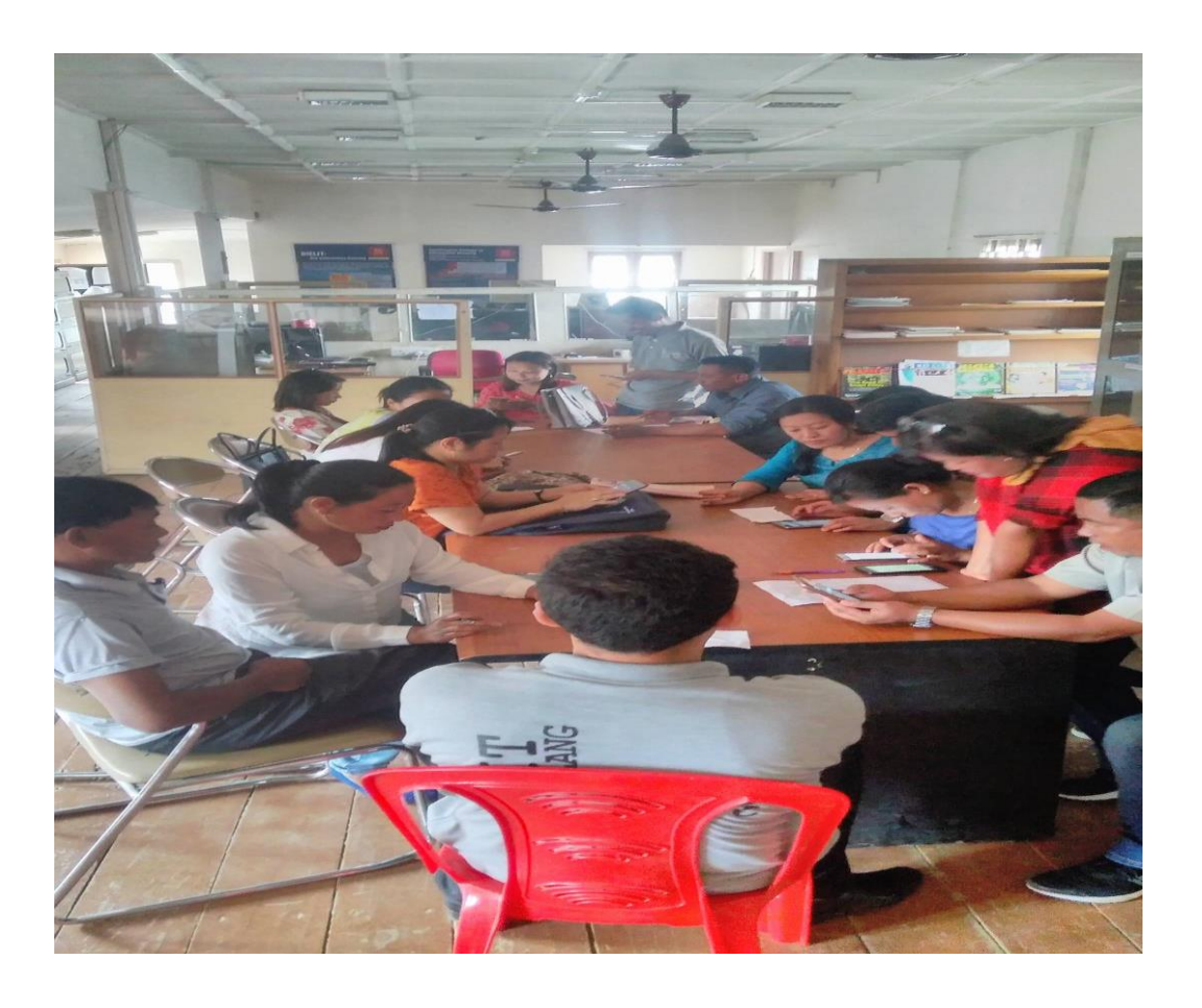
Giving feedback from their mobile phone