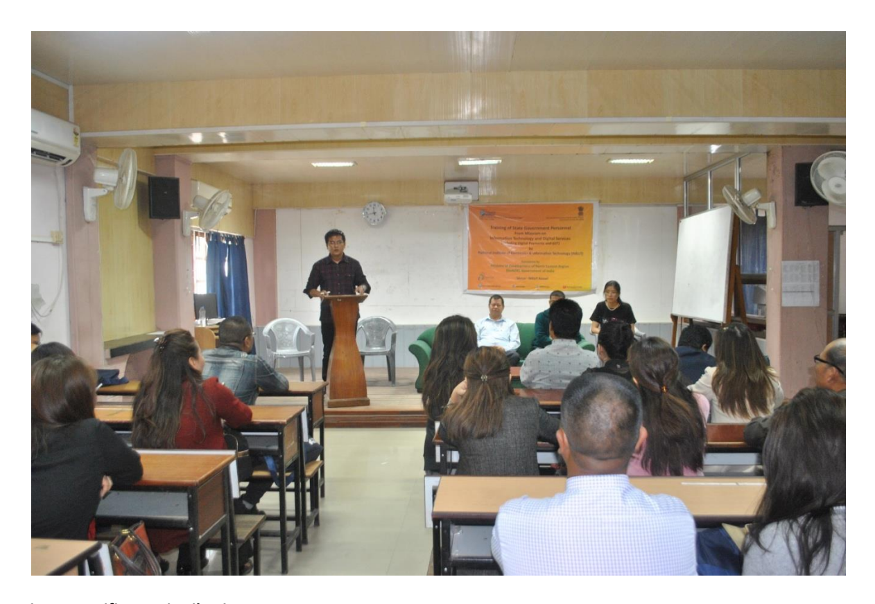
Pic. 1:-Certificate Distribution Programme