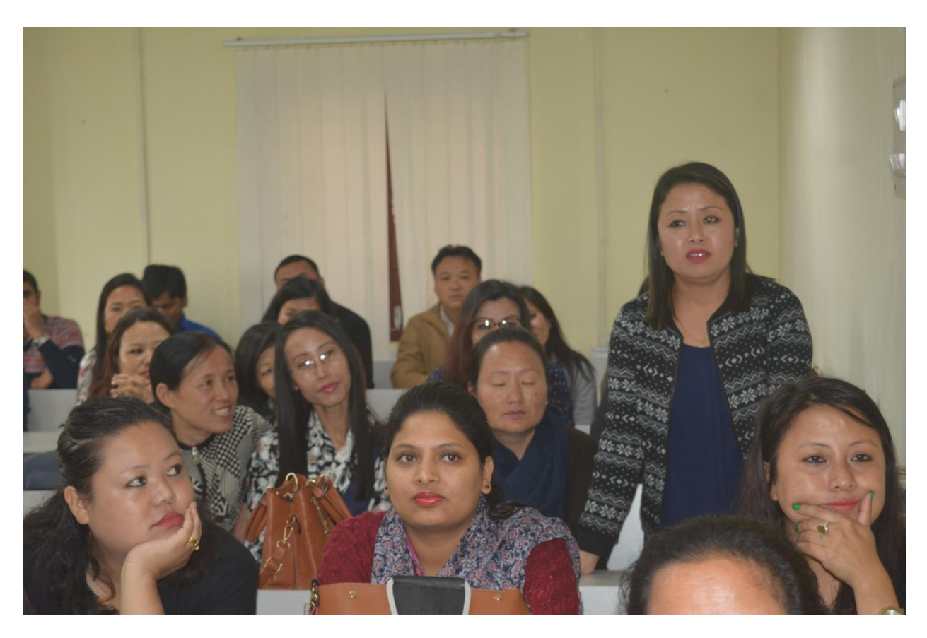
Photo 3: Introduction by the participants of 83<sup>rd</sup> batch