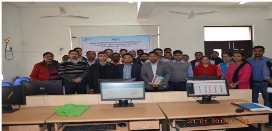
Participants of 1 st Batch- of Training along with Director, IT, Govt. of Tripura, Director In-charge, NIELIT Agartala, Officials and Faculties of NIELIT Agartala