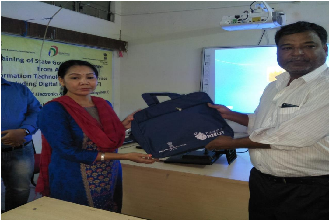
NIELIT GUWAHATI DIBRUGARH EXTENSION CENTRE