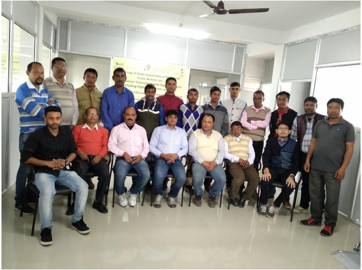
Dhubri Training Centre