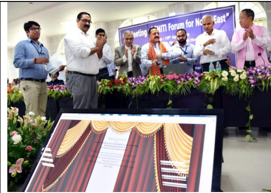
Dedication of the project