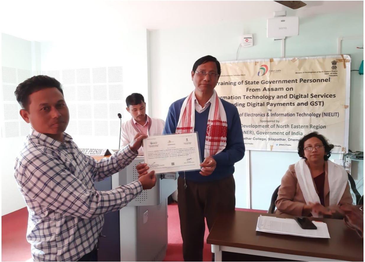
Majuli Training Centre