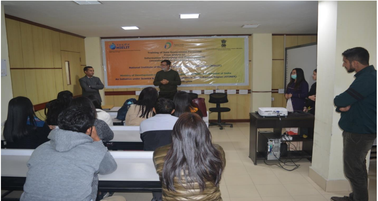
Photo 1: Inauguration session. NIELIT officials interacting with the participants during the inauguration of the 271 st batch at NIELIT, Gangtok on 19 th Nov 2018.