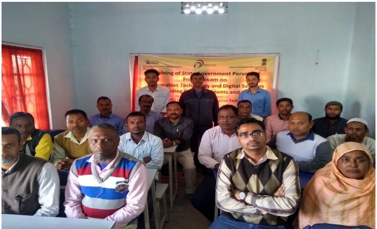
NIELIT GUWAHATI SILCHAR EXTENSION CENTRE