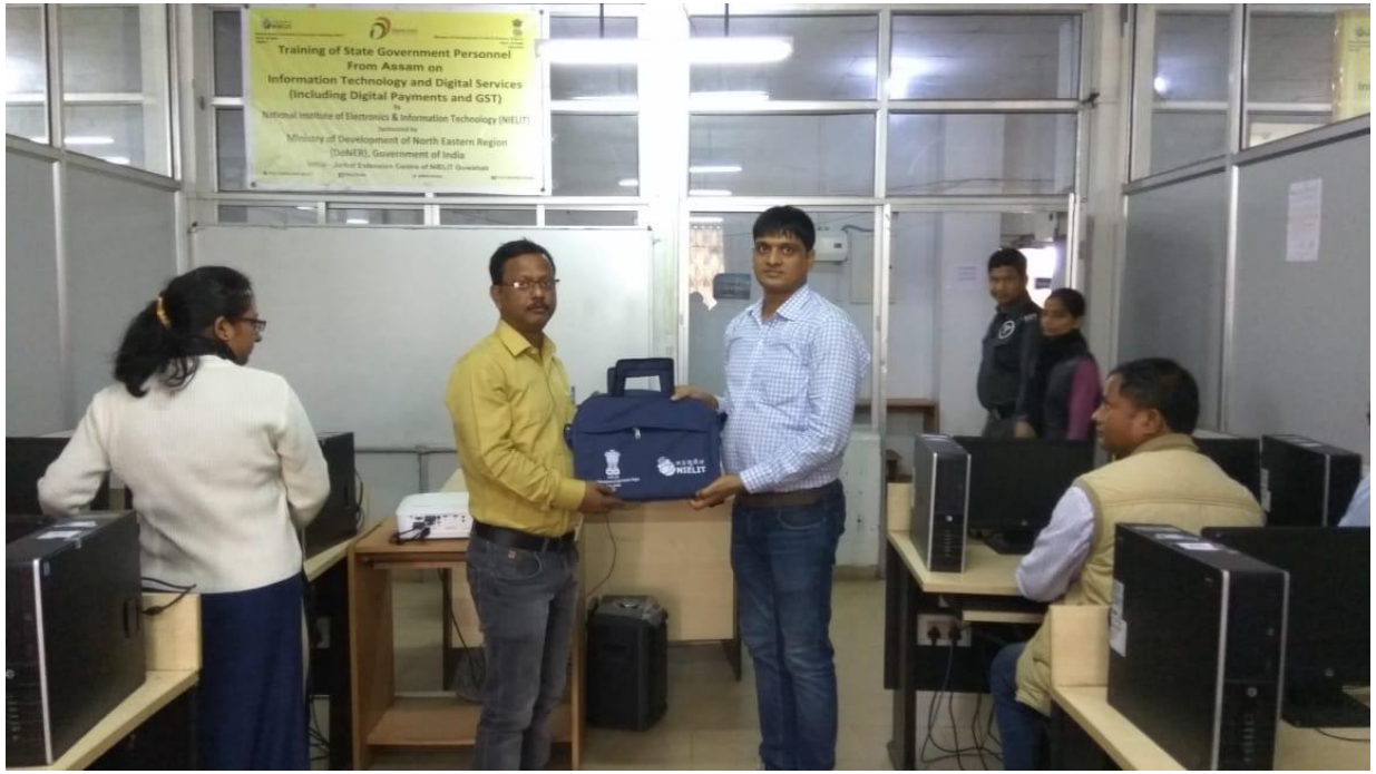
NIELIT GUWAHATI KOKRAJHAR EXTENSION CENTRE