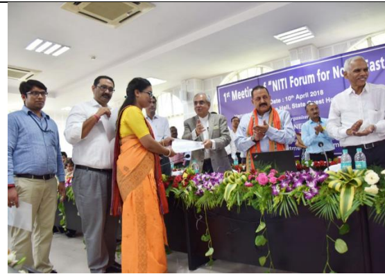
Certificate to Govt. Officials