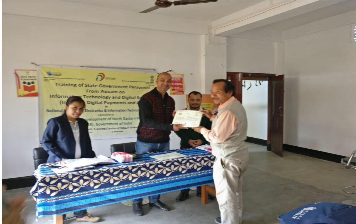
Sivsagar Training Centre