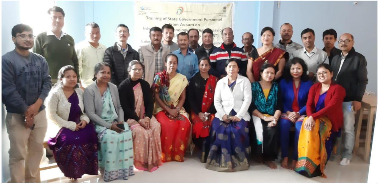
Silapthar Training Centre